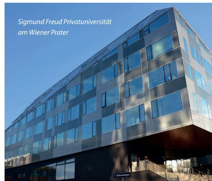
Sigmund Freud Privatuniversität am Wiener Prater

see hotel list on our website: www.highereducationlaw.eu