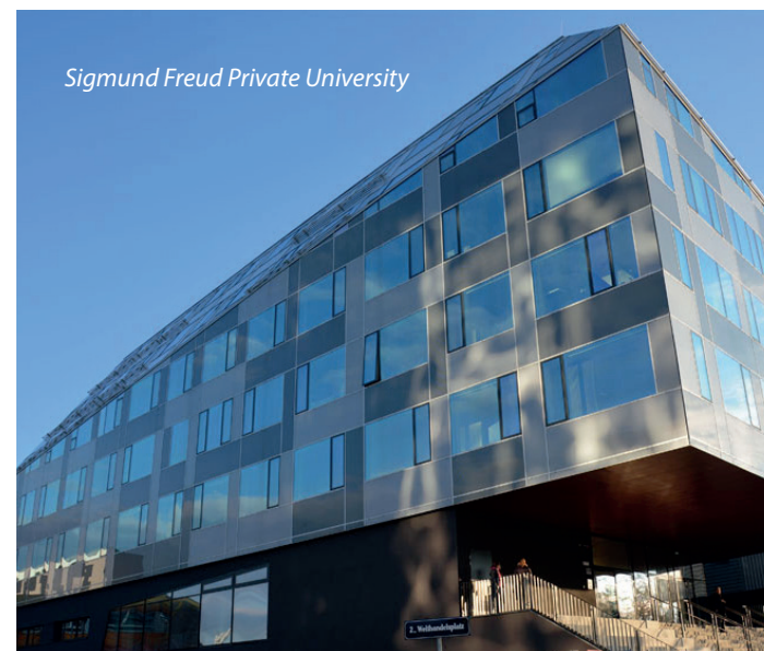
Sigmund Freud Private University

see hotel list on our website: www.highereducationlaw.eu